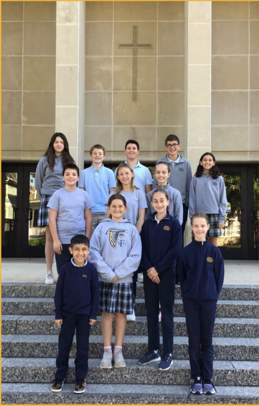
2022-2023 SFX Student Council

SUPPORTING OUR SCHOOL'S MISSION, STUDENTS AND STAFF.